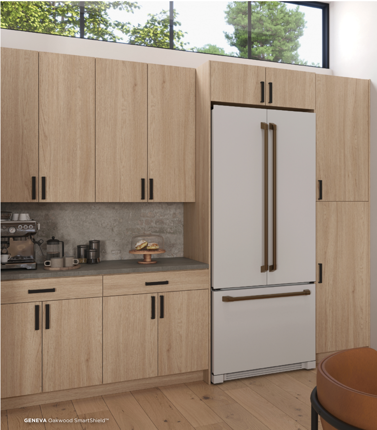
GENEVA Oakwood SmartShield™

Note: Exterior is color matched to door/drawer front. Separate color matched end panel not required on exposed ends.