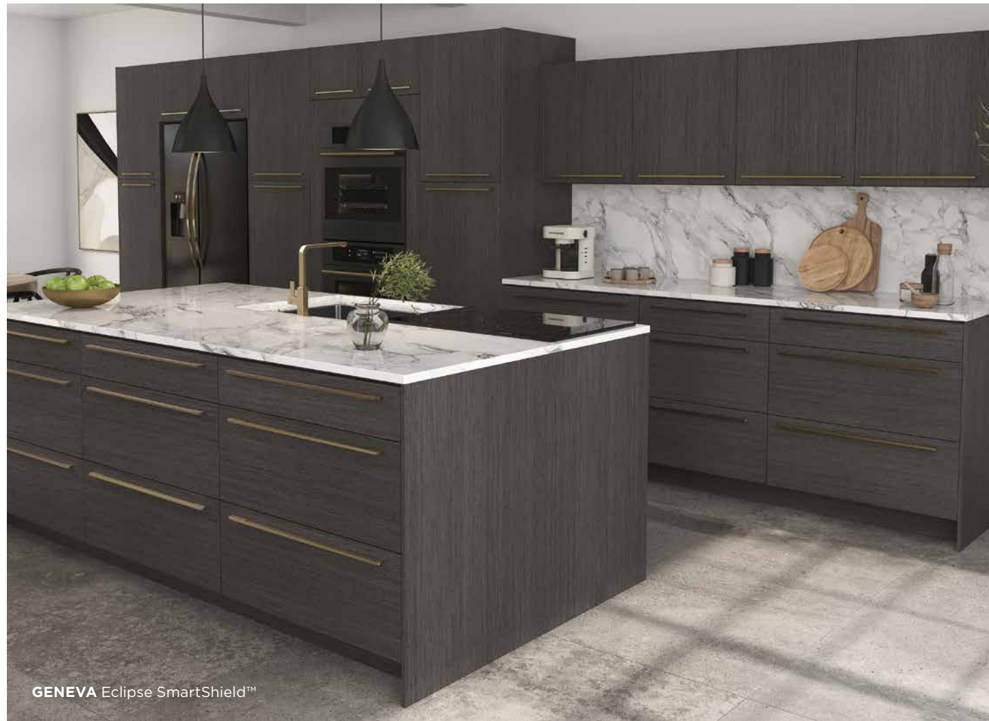
GENEVA Eclipse SmartShield™