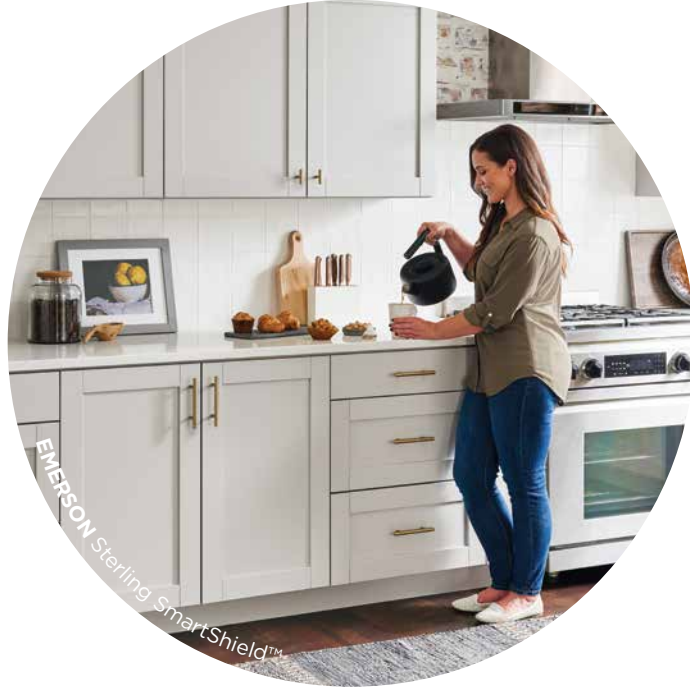
EMERSON Sterling SmartShield™