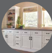
Kitchen & Bath

Find us on Instagram @ wolfhomeproducts for inspiration on your next project!