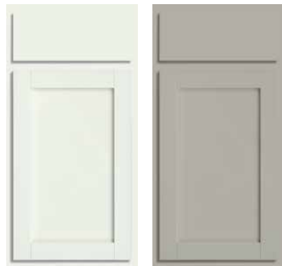
Pearl SmartShield™ Cinder SmartShield™