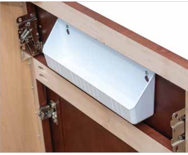
Sink Base Tip-Out Tray