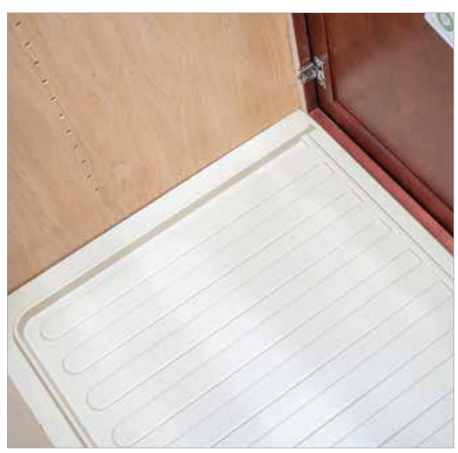
Sink Base Drip Tray