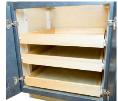
Figure A Holds up to (3) POS's