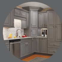
Kitchen & Bath

Wolf Home Products® is an innovator in the building products industry. We've cultivated our 175 years of business experience into a total satisfaction guarantee. With our vast inventory of kitchen and bath, outdoor living and building products, we deliver your orders in a fraction of the time and ensure you get unparalleled value — when and where you need it. Wolf stands behind our service because, above all, Wolf stands behind you.