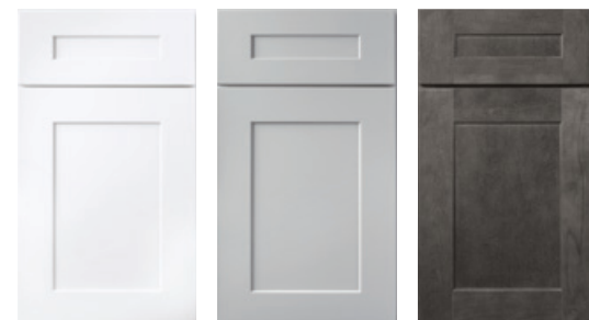
White Paint Pewter Paint Grey Stain