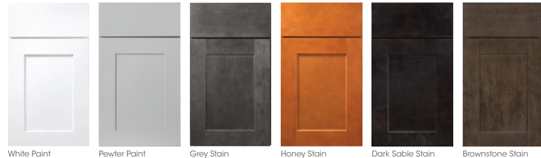
White Paint Pewter Paint Grey Stain Honey Stain Dark Sable Stain Brownstone Stain