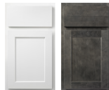
White Paint Grey Stain