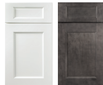
White Paint Grey Stain