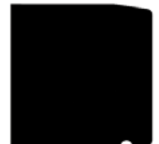
Subsill - 8 ft D69 - 1-3/8" x 1-3/8"