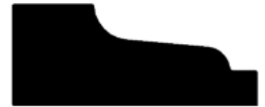
Solid Crown - 8 ft D211 - 15/16" x 2-1/4"