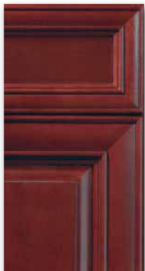
Crimson with Chocolate Glaze