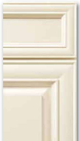
Painted Antique White