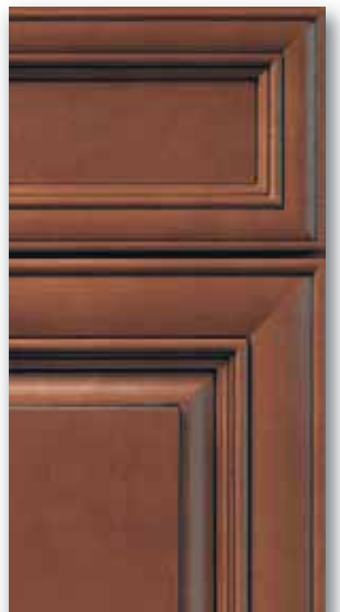
Heritage Brown with Chocolate Glaze

If you've been looking for the ultimate in classic all-wood cabinetry, your search is finally over. With a mitered pillow design and luxurious paint and stain/glaze finishes, our Hudson cabinets offer both timeless beauty and elegant styling. These are cabinets your guests will ooh and ahh over and you'll never grow tired of.