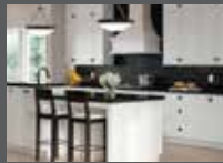
KITCHEN & BATH